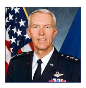
Lieutenant General (Ret.) Tad Oelstrom (USAFA '65), former Superintendent, U.S. Air Force Academy